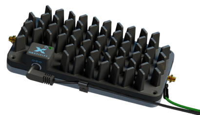
CEL-FI ROAM R41